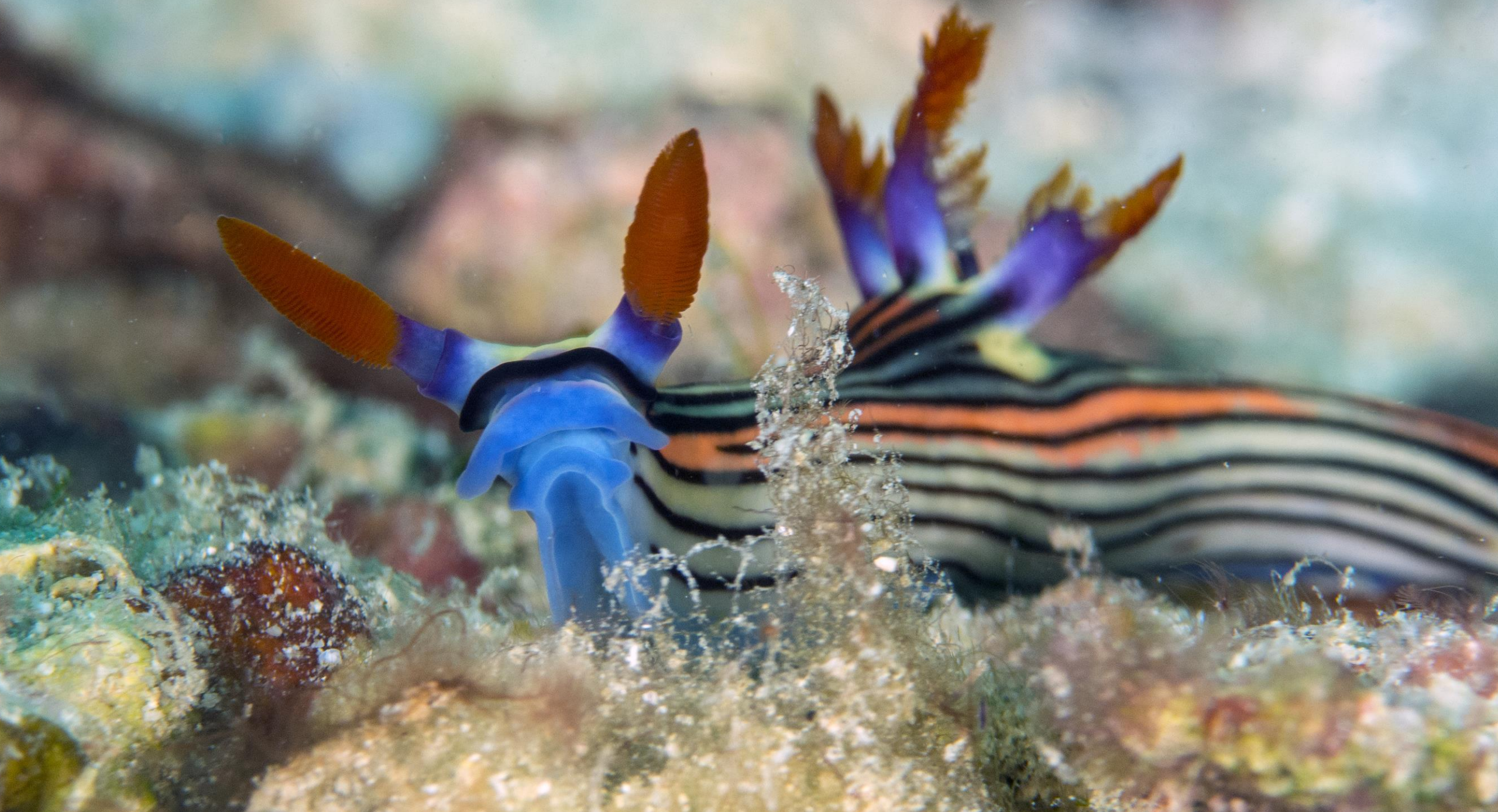
Nembrotha aurea , a dorid nudibranch: Mafia Island, Tanzania